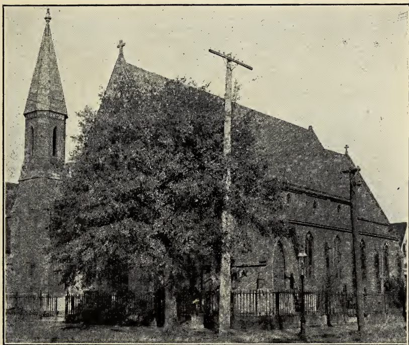
ST. JOHN'S CHURCH, WILMINGTON, N. C.