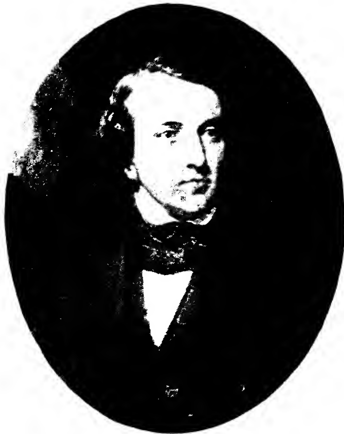
THOMAS B. SARGENT (From a portrait painted in London in 1842)