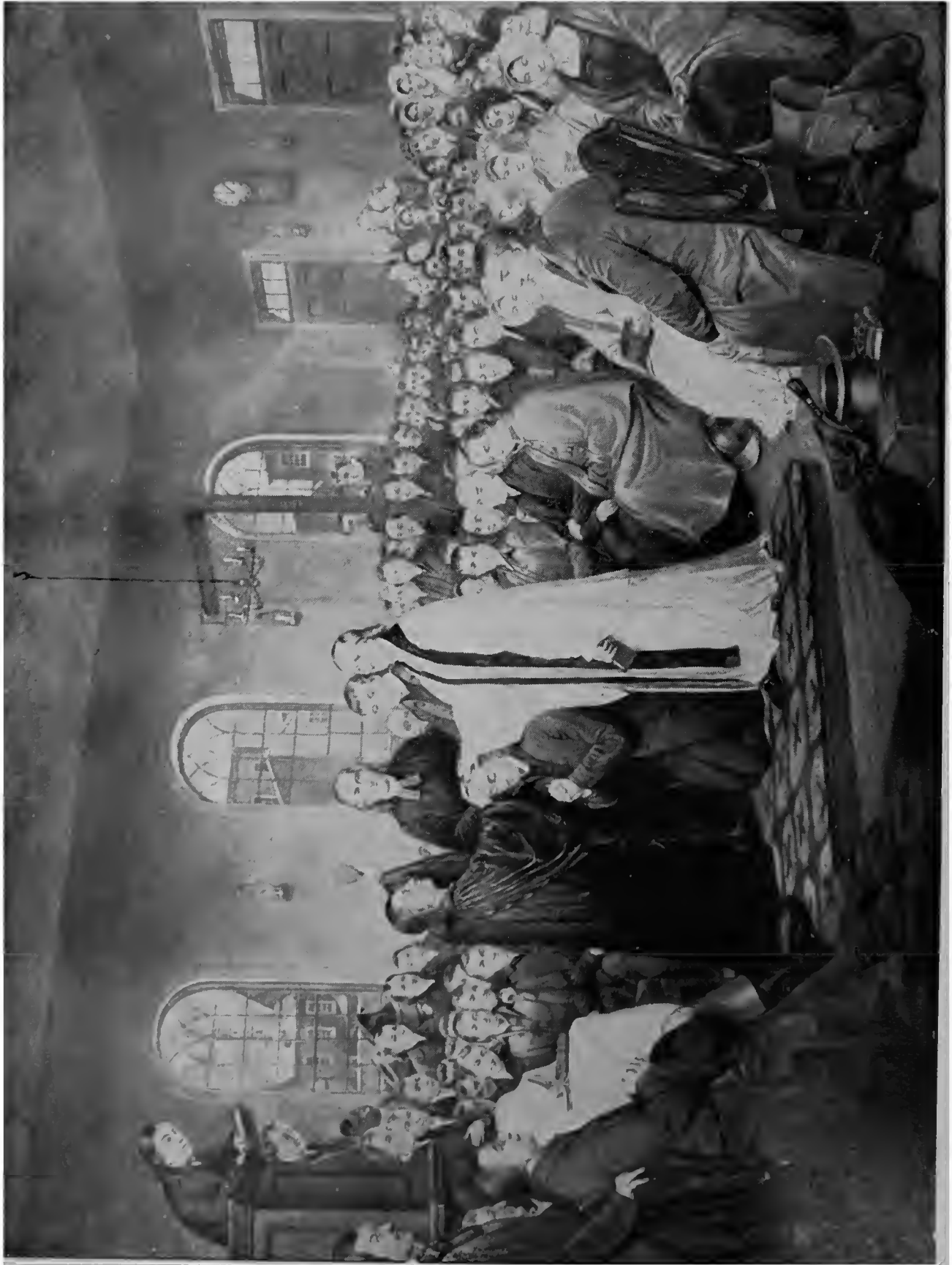
ORDINATION OF BISHOP ASBURY.