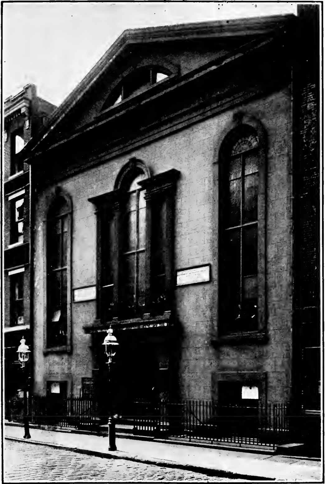
The First Methodist Church in America, John Street, New York