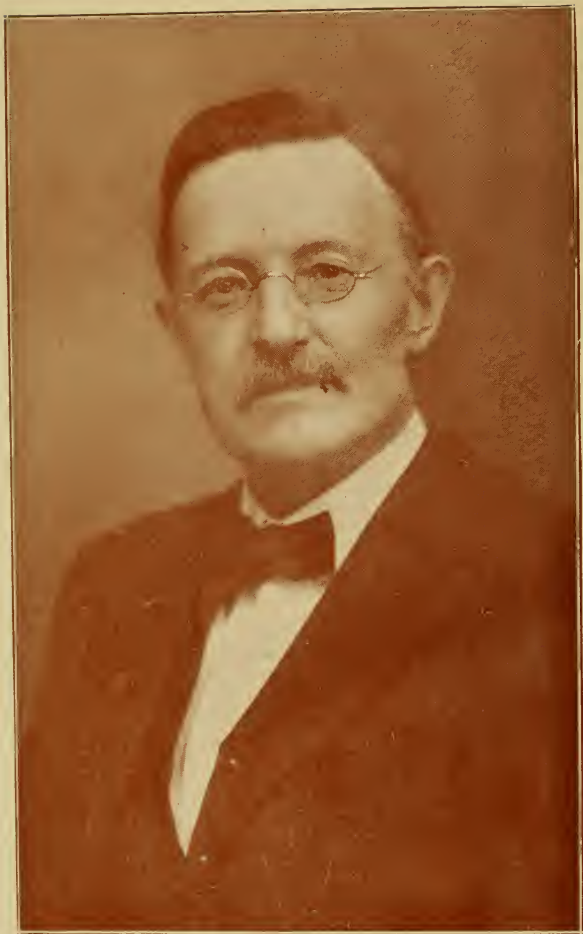
BISHOP COLLINS DENNY