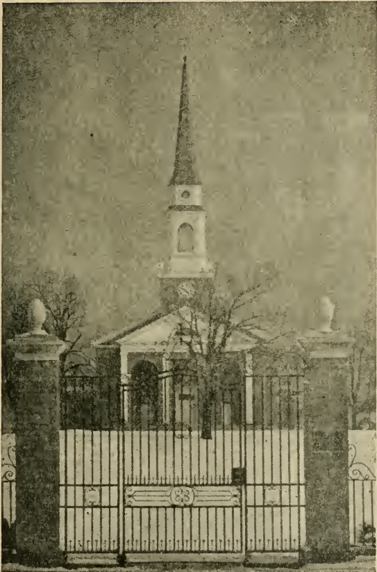
ANNIE MERNER PFEIFFER CHAPEL BENNETT COLLEGE