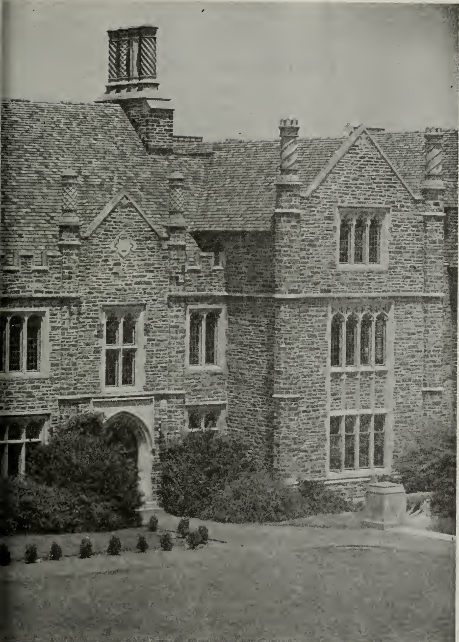
ENTRANCE TO THE DIVINITY SCHOOL