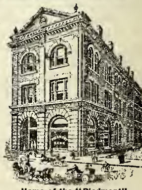
Home of the "Piedmont"

The Piedmont Trust Co., Burlington, N. C.