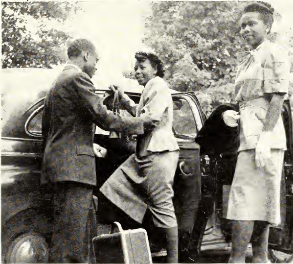
On to Shaw University to the 6th Annual Sunday School and Baptist Training Union Training Conference—June 28th—July 2nd.