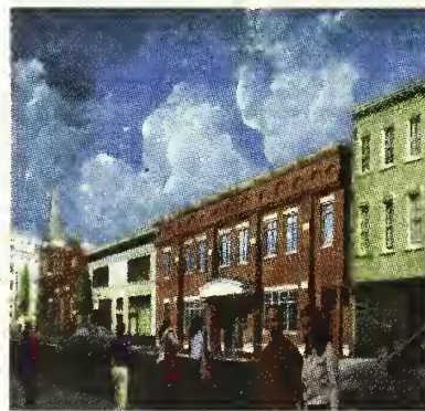
First Baptist Church Family Life Center- Downtown Raleigh

Call our office for reservations and information