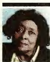
President of the Woman's Baptist Home and Foreign Missionary Convention of N.C.