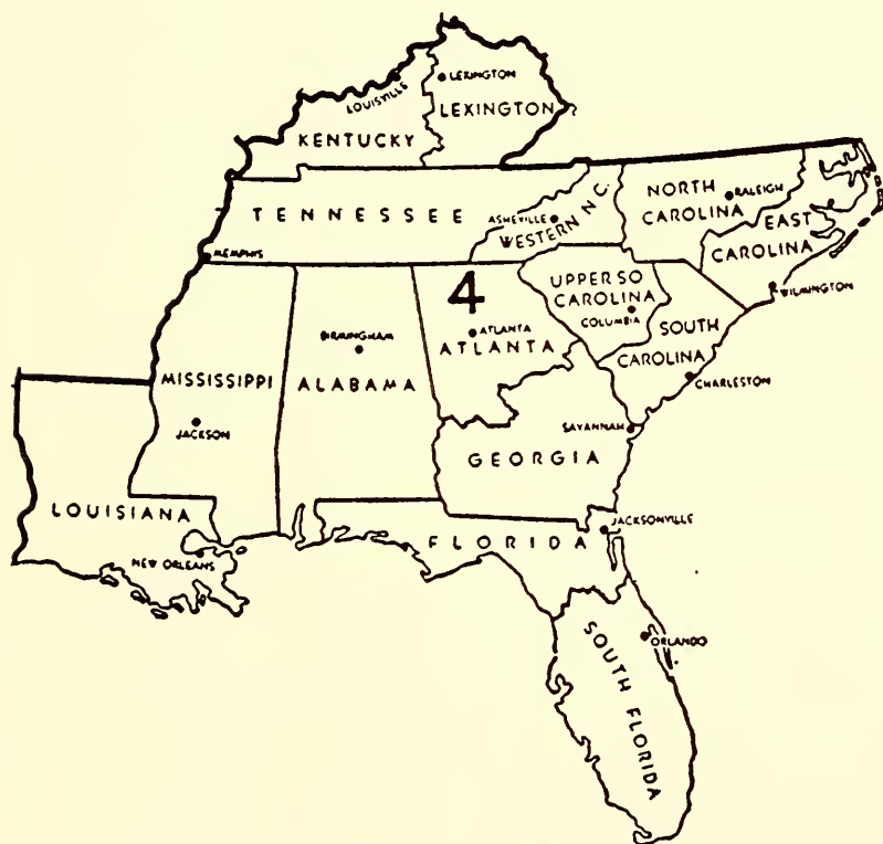
PROVINCE OF SEWANEE