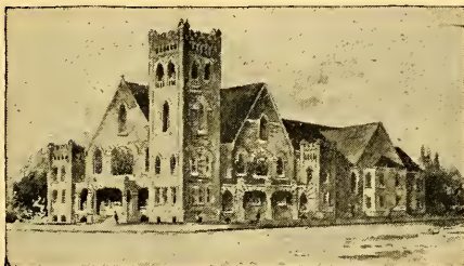
First Baptist Church Greensboro