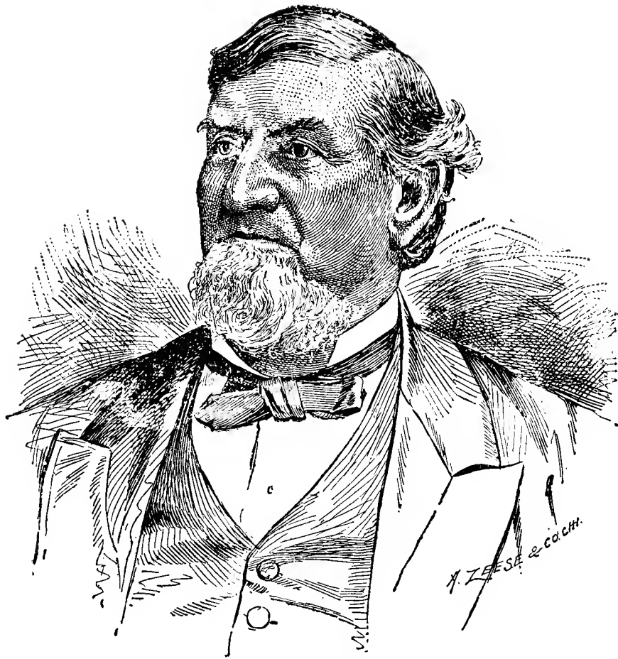
JUDGE WILLIAM B. WOOD.