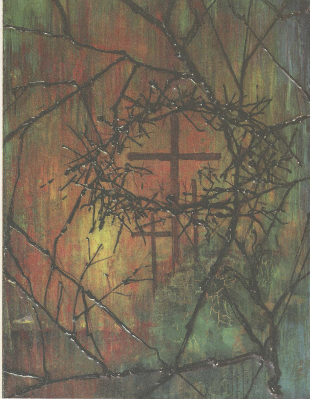
TRINITY AVENUE PRESBYTERIAN CHURCH Maundy Thursday, 1967