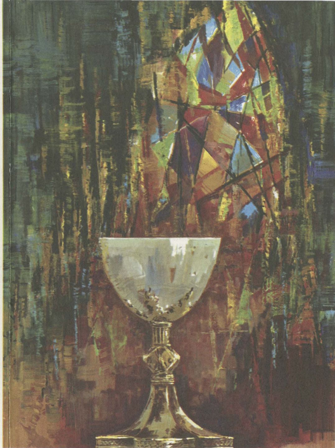
WORLD-WIDE COMMUNION SUNDAY, 1966