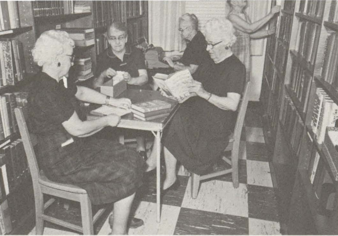
The Library Committee

"After living ten years in this wonderful Presbyterian Home, I can say, 'We are one happy family'." . . .