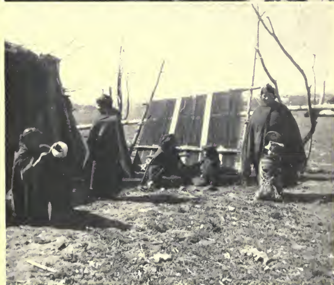
TWO METHODISTS IN THE MOUNTAINS They were faithful amid very severe persecutions. ARAUCANIAN INDIAN WOMEN SPINNING AND WEAVING