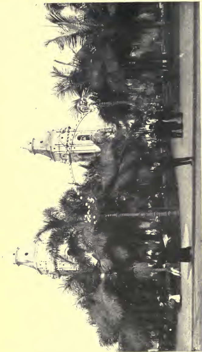
CATHEDRAL AND PLAZA—LIMA, PERU