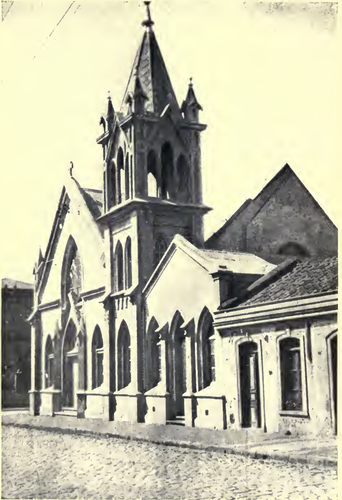
METHODIST EPISCOPAL CHURCH, CONCEPCION