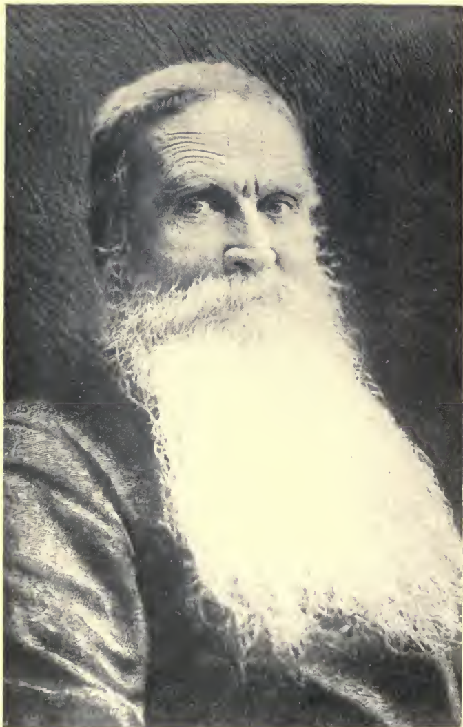
BISHOP WILLIAM TAYLOR