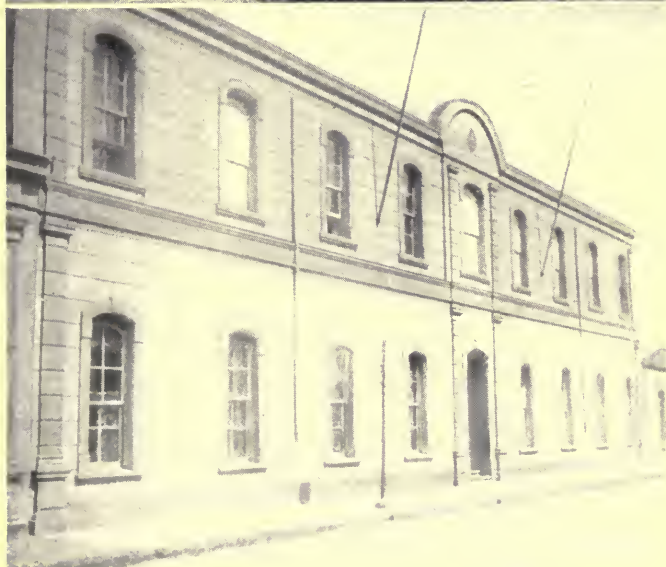
A view of one of the patios , interior courts, of Concepcion College. A front view of the first building erected for Concepcion College, Concepcion, Chile.