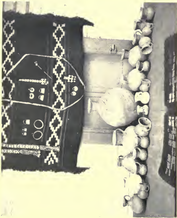
ARAUCANIAN INDIAN POTTERY, BLANKET (PONCHO) SADDLE BLANKET AND WOMEN'S JEWELS