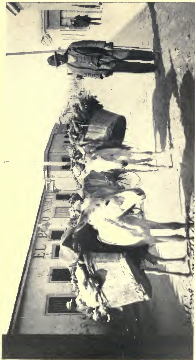
THE VEGETABLE MAN