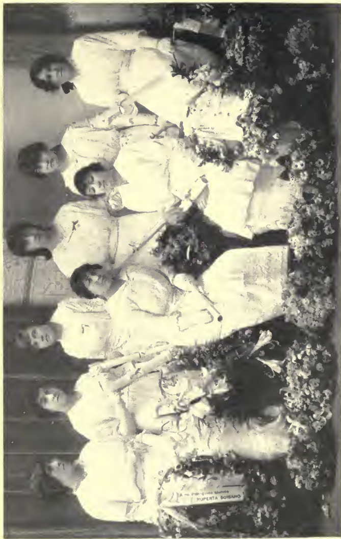
GRADUATES, CLASS OF 1914, CONCEPCION COLLEGE, CHILE