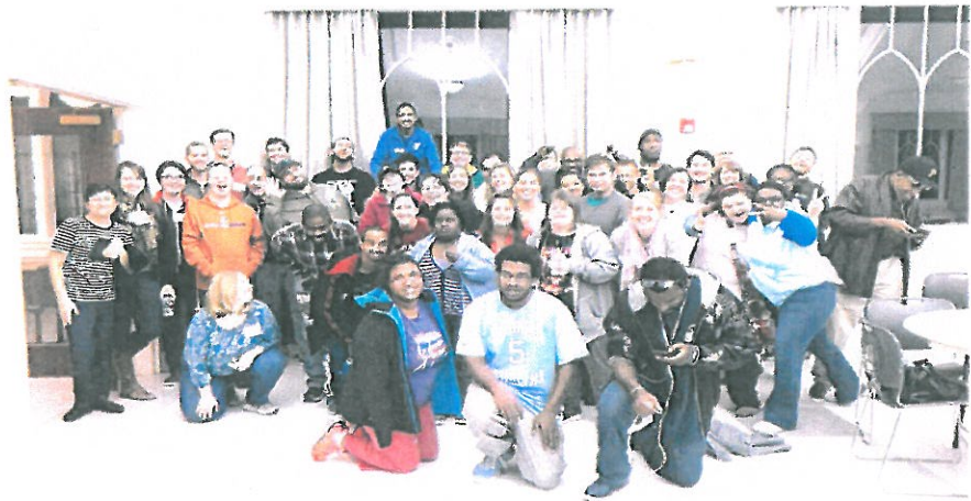
New friends are waiting to meet you at the monthly Reality Ministry dinners at TAPC!