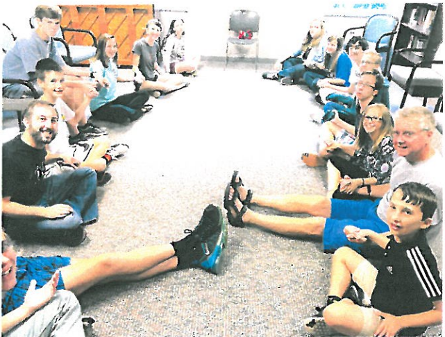
Above: Youth and adults lined up for a game involving a race to squeeze hands down the line. Even the simplest games at youth group are tons of fun.