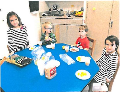
Above: Our preK/K class enjoys a snack after a rigorous hour in Sunday School.