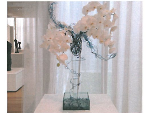
Example of the various artwork viewed during visit to N.C. Museum of Art with host Ellen Stone in March. Before the tour, Primetimers enjoyed lunch at Panera Bread.