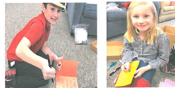
Kids Club children making cards for Housing for New Hope