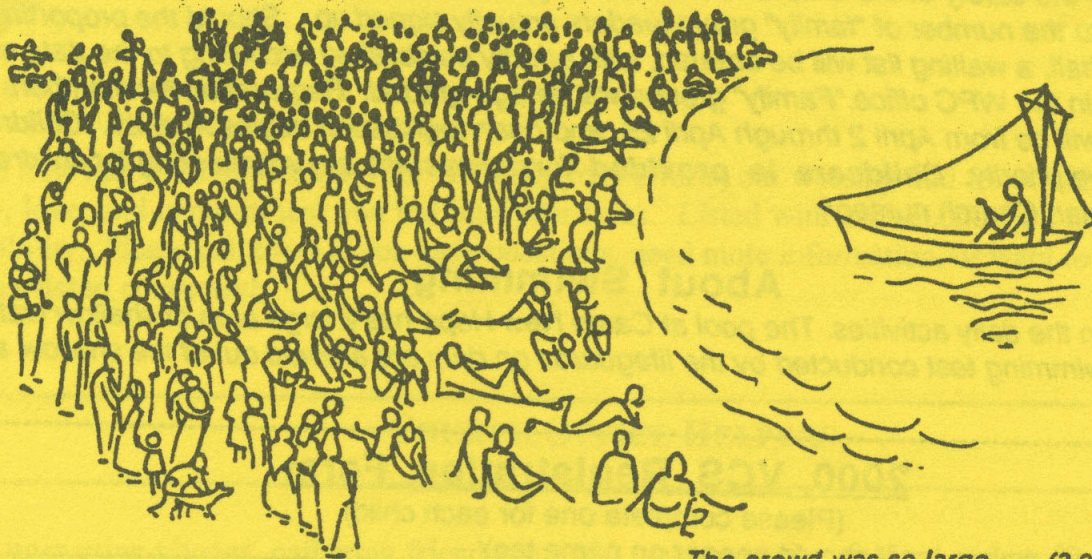
The crowd was so large (3.9)

Jesus told many stories and parables to his followers. Join us this week to explore some of the parables and stories he told. We will look at what the meanings were for the people of Jesus' day, and what the meanings are for us today.