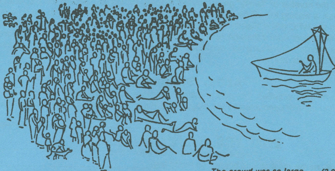
The crowd was so large (3.9)

Jesus told many stories and parables to his followers. Join us this week to explore some of the parables and stories he told. We will look at what the meanings were for the people of Jesus' day, and what the meanings are for us today.