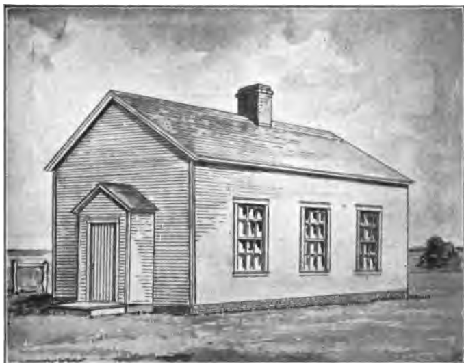
FIRST CHURCH BUILT IN LINCOLN, NEBRASKA, 1868. SIZE, 25 x 40. SEATING CAPACITY, 200.