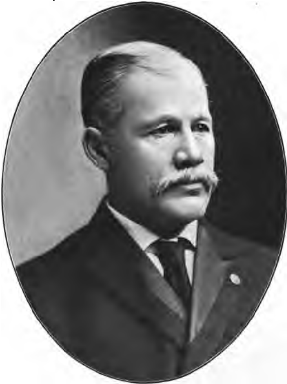
GOVERNOR J. H. MICKEY. PRESIDENT BOARD OF TRUSTEES.