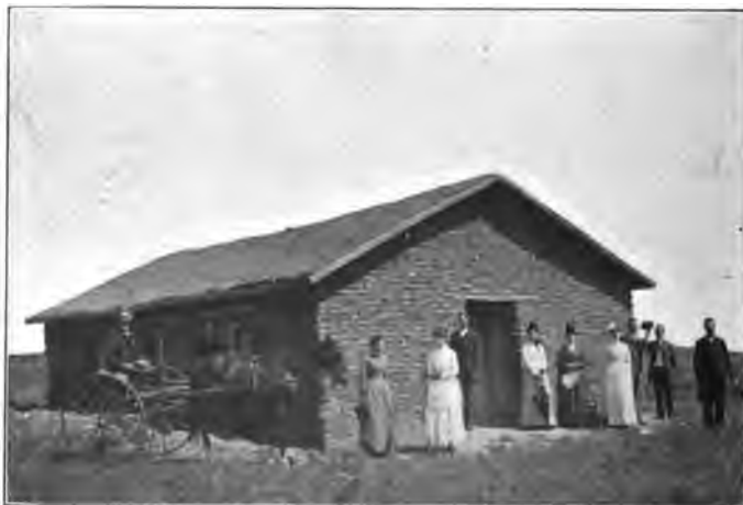
SOD METHODIST CHURCH BUILT IN TYRONE, RED WILLOW COUNTY, IN 1886. A TYPE OF MANY OF THE FIRST CHURCHES ERECTED IN NEBRASKA.

This case at Wayne is mentioned as typical of a great many. Perhaps no part of our work has represented more of faith and the spirit of self-sacrifice than in the