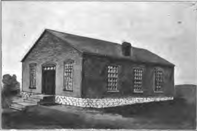
FIRST METHODIST CHURCH BUILT IN NEBRASKA, AT NEBRASKA CITY, 1855-6.

Besides, the Church Extension Society has been in