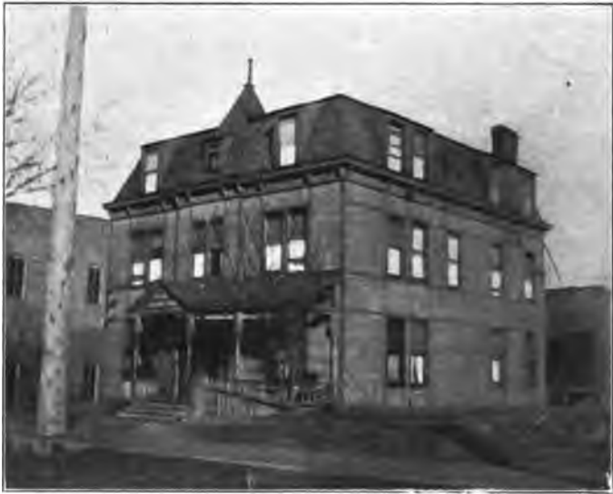
THE OLD METHODIST HOSPITAL AT OMAHA.