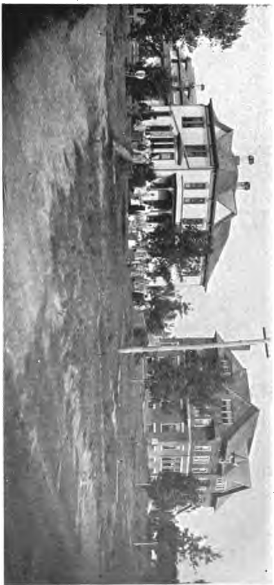
THE MOTHERS' JEWELS HOME.