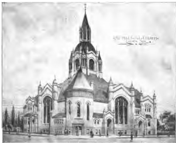
PRESENT ST. PAUL'S CHURCH, LINCOLN, NEBRASKA. SIZE, 142 x 150. SEATING CAPACITY, 2,300.