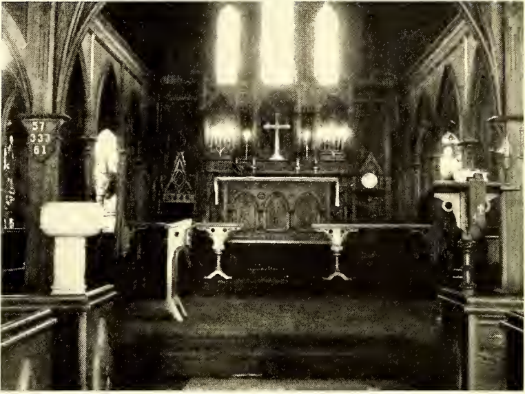
INTERIOR, ST. LUKE'S CHURCH.